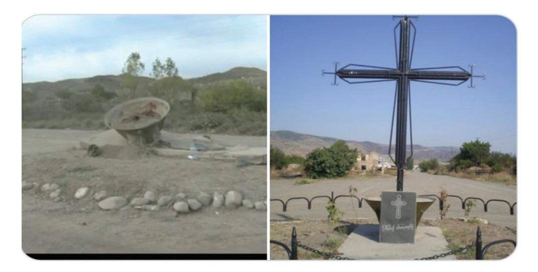
Figura 9 The fall of the metal cross of the city of Vorotan, photo by https://war.karabakhrecords.info/.

toppled a metal cross<sup>24</sup> (fig. 9), the cross from the dome of St. Harutyun Church in Hadrut region was removed<sup>25</sup>, the cross of Spitak Khach church in Vank village of Hadrut region<sup>26</sup>, as well as the cross of Mekhakavan Zoravor St. Astsvatsatsin or St. Mariam Astsvatsatsin church, which was removed before the church was completely destroyed<sup>27</sup>.