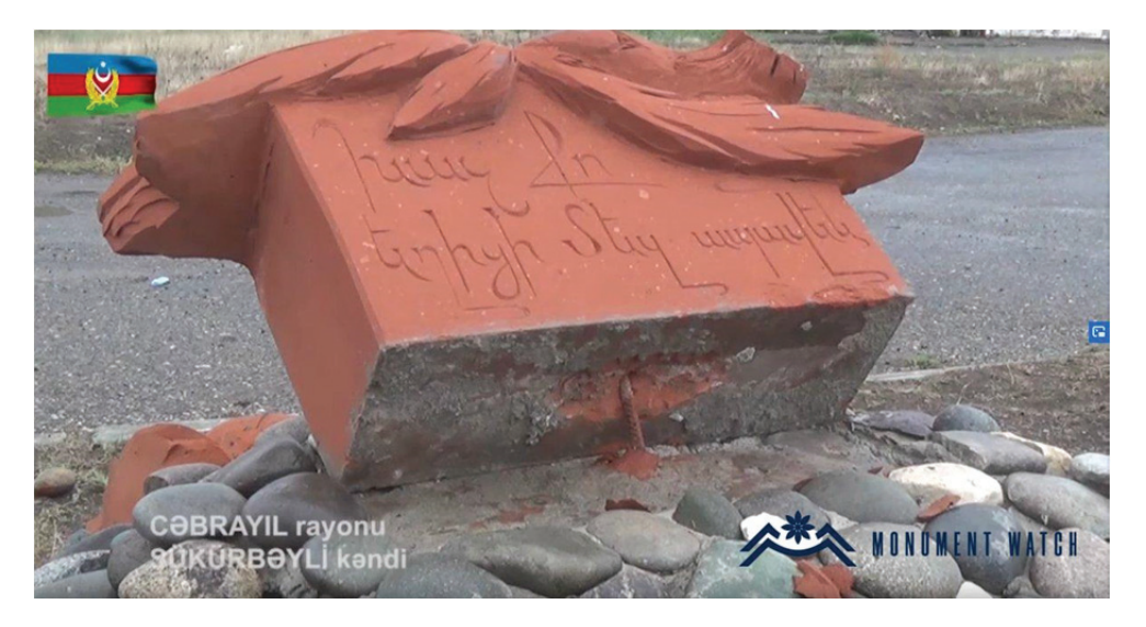
Fig. 5 The destruction of the khachkar, Jrakan (Jabrayil), photo by http://monumentwatch.org/.

Still during the war, in the video published by the Ministry of Defense of Azerbaijan on October 7, 2020, it is clearly seen that in the village of Shykyurbeili of the Jrakan (Jabrayil) region, the Christian monument made of tuff in a form of crosses bearing an Armenian inscription "Your cross will be our support" by Varazdat Hambardzumyan, has been demolished<sup>18</sup>. In the video, it can be seen that the khachkar is almost completely broken, only the part of the inscription remained half standing (fig. 5).