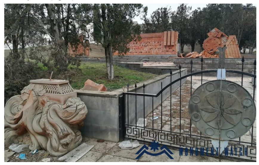
Fig. 6 The destruction of the "Revived Talish" monument, photo by http://monumentwatch.org/.

On December 3, 2020, photos are published on Facebook, in which we see that after the 44-day war, the Azerbaijanis destroyed the "Revived Talish" monument of the Talish village of the Martakert region, the khachkars placed on both sides of the entrance are again the works of Varazdat Hambardzumyan<sup>21</sup> (fig. 6).