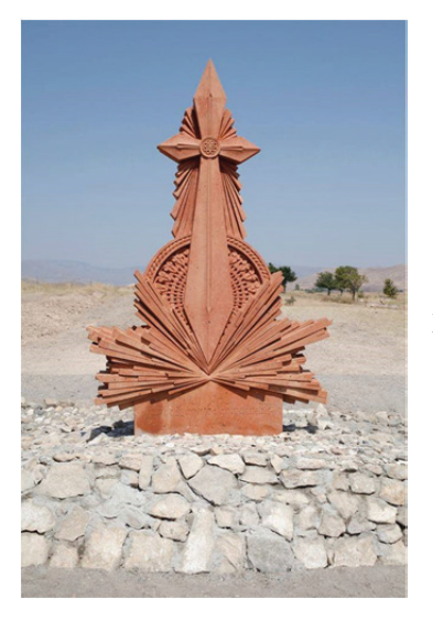
Fig. 4 Sword-cross in the defense zone of Artsakh, photo by V. Hambardzumyan.

Through these details, the masters tried to give a victorious-defensive image to the composition and thereby connect it to the theme of the liberation war. The most unique manifestation, which is fundamentally related to the liberation struggle of Artsakh, is a unique and new phenomenon in the khachkar culture: "sword-crosses" (or "border crosses", fig. 4). The basis of the perception of the cross as the most victorious weapon and symbol of victory comes first of all from the redemptive crucifixion of Christ, the victory over death, the rite of Baptism, immersing the cross in water to kill or bind the dragon, death and sin, the scene of the destruction of hell, the visions of Gregory the Illuminator and Constantine the Great, finally, the similarity of the cross with the sword<sup>15</sup>. Khachkar inscriptions also describe the cross as an unfading weapon that defeats enemies and is infused and anointed with divine blood<sup>16</sup>.