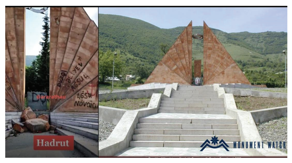
Fig. 7 The destruction of the monument dedicated to the victims of Artsakh war, photo by http://monumentwatch.org/.

Next case of vandalism is the monument dedicated to the victims of Artsakh war. A video appears on the Internet, where Azerbaijani militants opened fire in the direction of khachkar. And already on June 23, 2021, a user named "Karabakhskii Vestnik" ("Карабахский Вестник", "Karabakh Bulletin") posted on the Telegram, where it is clearly seen that the khachkar is completely broken, only the base remains standing, and the entire monument is desecrated<sup>22</sup> (fig. 7).