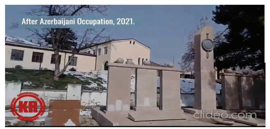
Figura 8 The destruction of the khachkar of Ukhtadzor village, photo by https://war.karabakhrecords.info/.

Next, we see the destruction of the khachkar placed in the courtyard of the Ghazanchetsots church in Shushi.